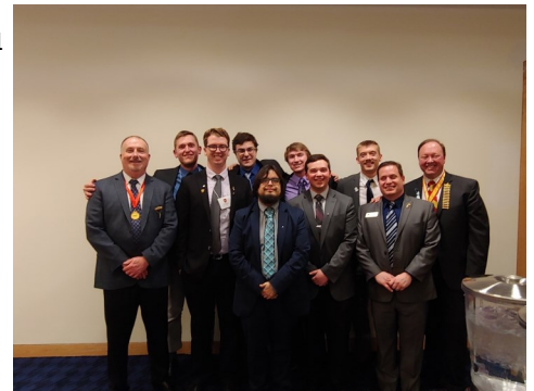
Current Actives and AM’s with International Executive Board Members