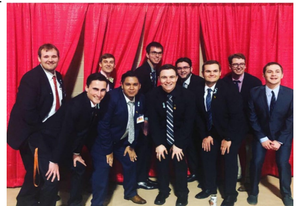
Spring Class of 2017 Celebrating 50 th