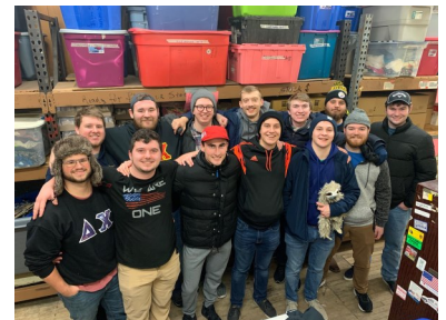
Granger Food Drop with Brothers/Alumni