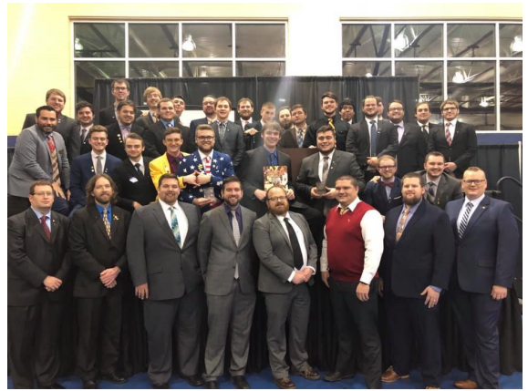
Brothers and Alumni Receiving Awards at Region V RLC 2019