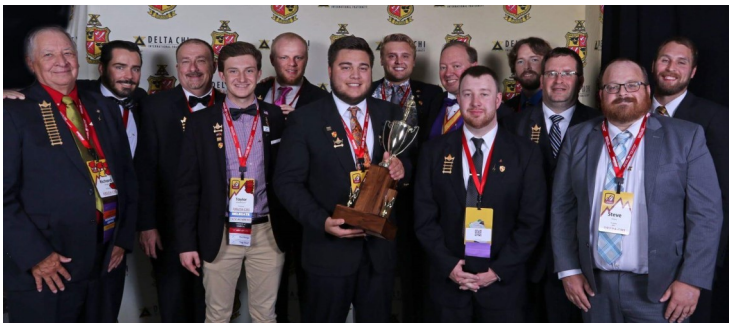
Accepting the 2017-2018 Presidents Cup

This event is an incredible opportunity for everyone involved, active or alum. This truly is a brotherhood of a lifetime and attending this event reconnects and ignites a new flame in your ability to be involved with Delta Chi. The 2020 International Convention will be held in St. Louis, Missouri and we hope to see a large number of Tri-State brothers!