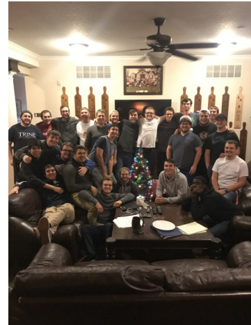
Christmas time bonding with Brothers