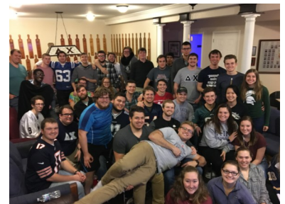
Super Bowl mixer with Theta Phi Alpha