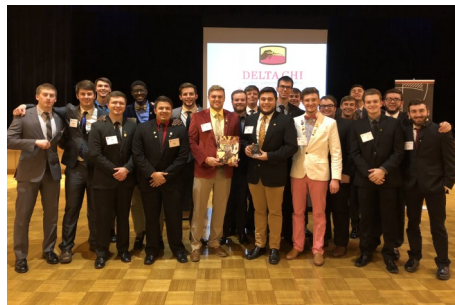
Accepting the award for Most Outstanding Alumni Relations at the 2018 Regional Leadership Conference

At the 2018 Regional Leadership Conference, held at Northern Illinois University, we bid to host the Conference at Trine University in 2019. We were